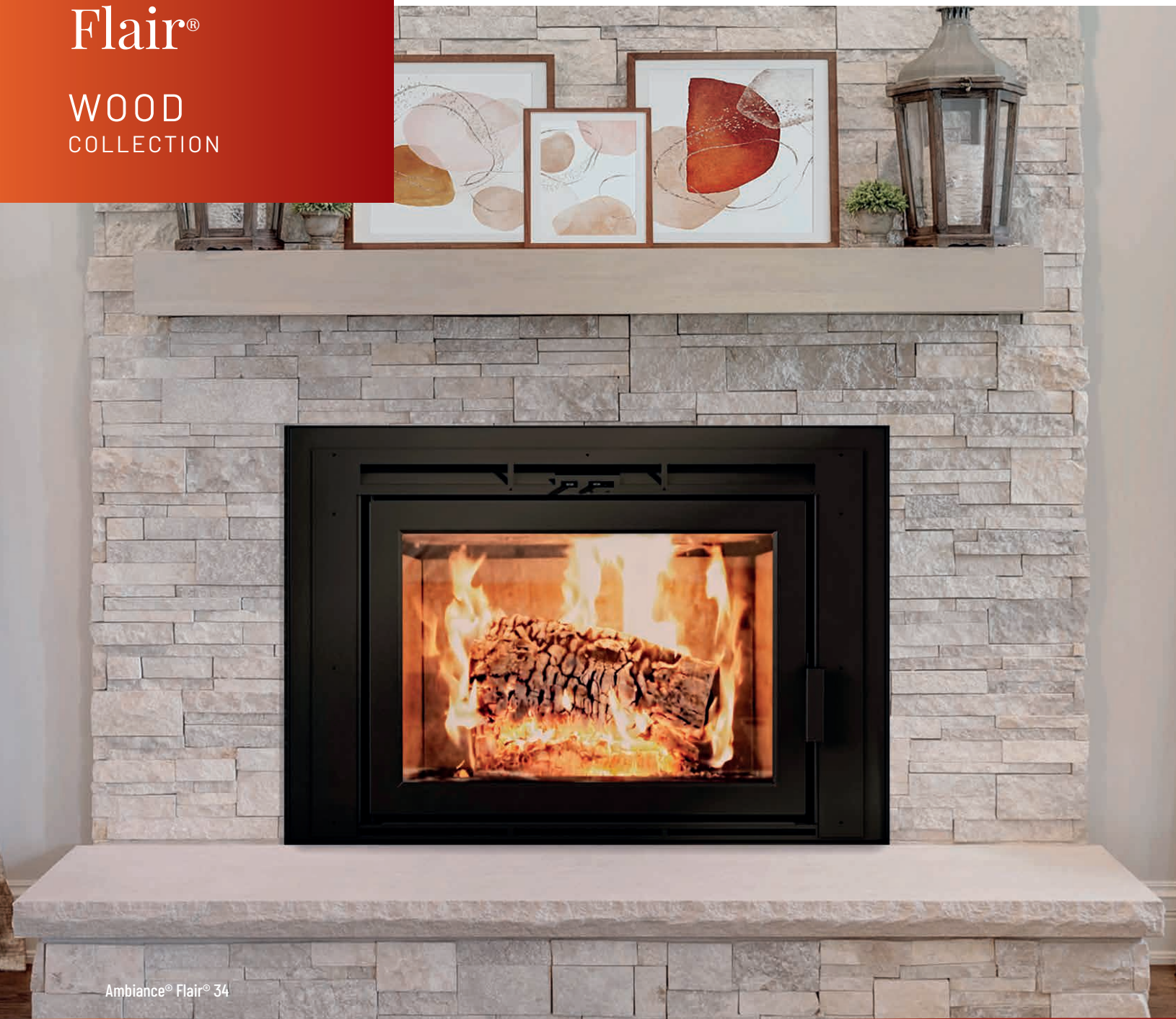
Ambiance® Flair® 34